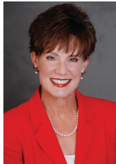
Carol LeBeau, former San Diego news anchor

Depression and anxiety can happen to anybody at any time and should not be taken lightly. One of the most difficult things about overcoming depression and anxiety can be the stigma associated with these types of mental illness.